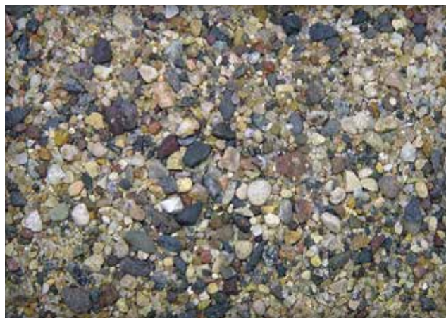
Figure 3. Example of sand from the ICPI bedding sand test program with a total combined percentage of sub-angular and sub-rounded particles equal to 65% according to ASTM D2488

Recommended Material Properties —Table 3 lists the primary and secondary material properties that should be considered when selecting bedding sands for vehicular applications. Bedding sands may exceed the gradation requirement for the maximum amount passing the No. 200 (0.075 mm) sieve as long as the sand meets degradation and permeability recommendations in Table 3. Micro-Deval degradation testing can be replaced with sodium sulfate or magnesium soundness testing as long as this test is accompanied by the other primary material property tests listed in Table 3. Other material properties listed, such as petrography and angularity testing are at the discretion of the specifier and may offer additional insight into bedding sand performance.